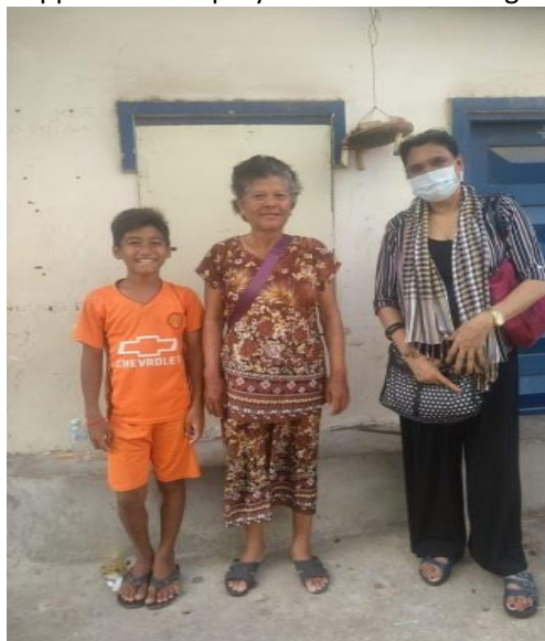
Chetra's and Grandma's small rented room